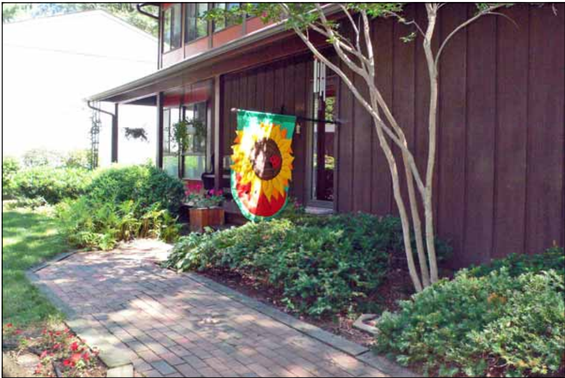
5710 Old Buggy Court Your Next Home!